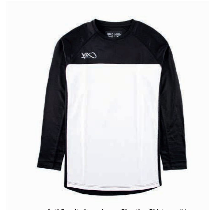
Anti Gravity Longsleeve Shooting Shirt 2212-4201