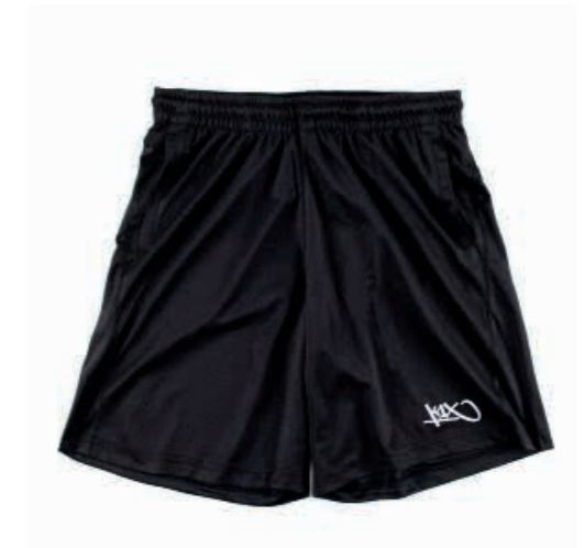
Hardwood Coaches Shorts 2212-4112