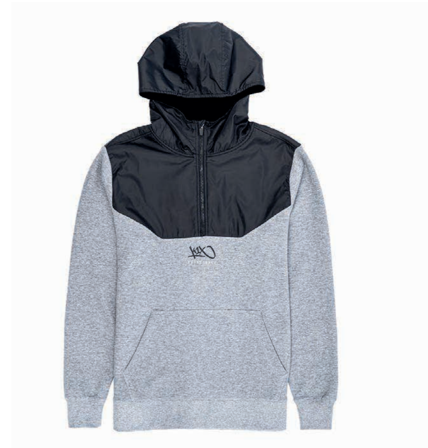
KIX Hardwood Halfzip Hoody 2212-2201